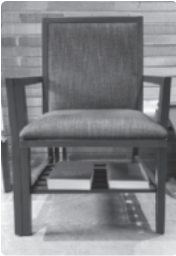
Sample of our beautiful new sanctuary chairs.