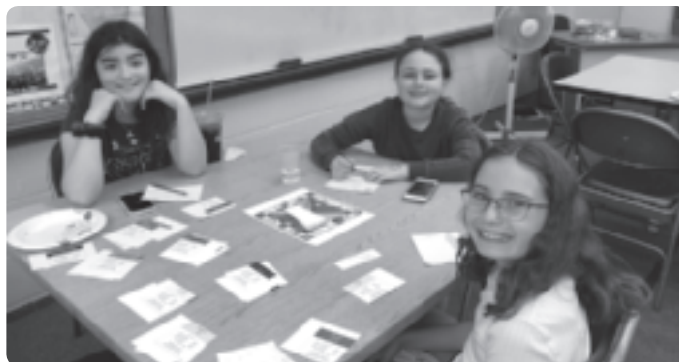
Students in 5th grade play a middot (Jewish values) board game.