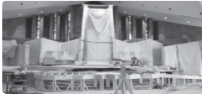
New bimah and ramps are being framed.