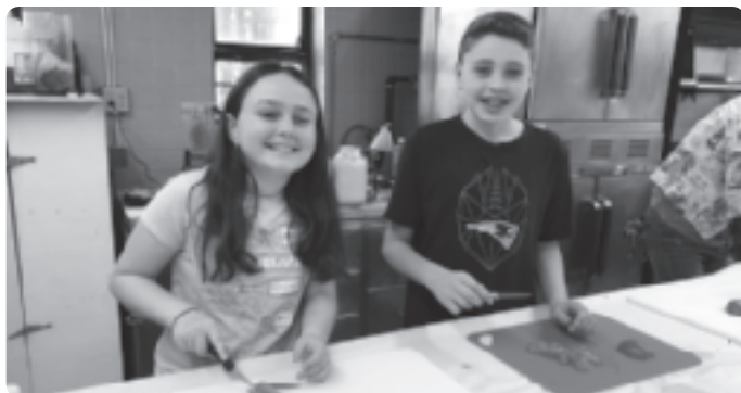
Students prepare Israeli salad for Yom Ha'atzmaut.